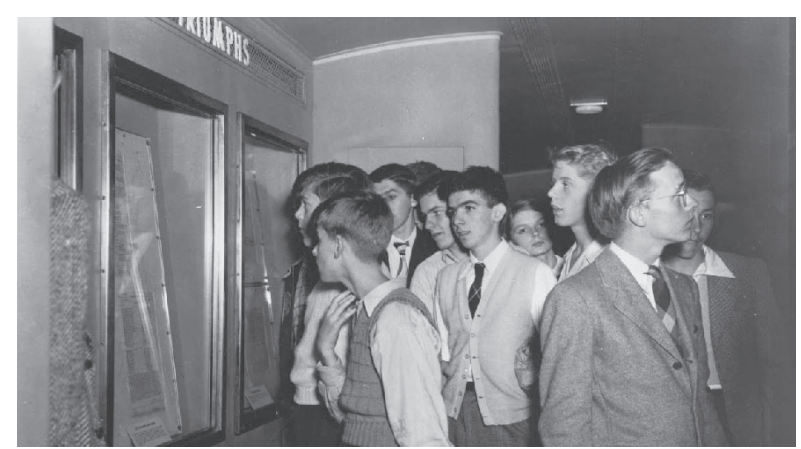
A group of students views the displays on the Freedom Train. Crowds of every age, race and economic group came to visit the exhibits.

Unbeknownst to Robeson, the AHF had early on made