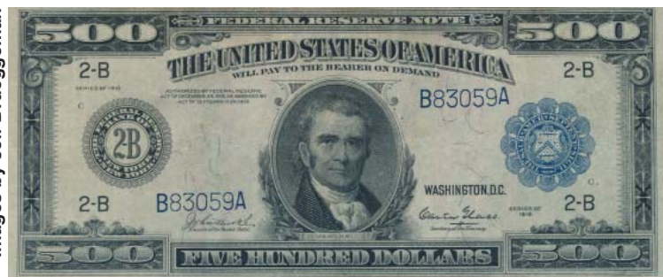
Chief Justice John Marshall's image appeared on the first $500 bill issued by the Federal Reserve system in 1918.

Salmon P. Chase is well known as the sixth Chief Justice. But his more enduring legacy may be as the man who started the era of modern paper money in the United States. Prior to his appointment to the Court, Chase served as Lincoln's Secretary of the Treasury and it was under his direction as Secretary, that paper money was first issued by the U.S. government.