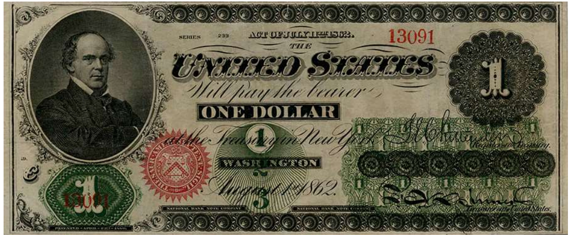
One Dollar Legal Tender Note from 1862 featuring Salmon P. Chase

Despite several other Justices having served as Treasury Secretary (Levi Woodbury, Roger B. Taney, and Fred M.