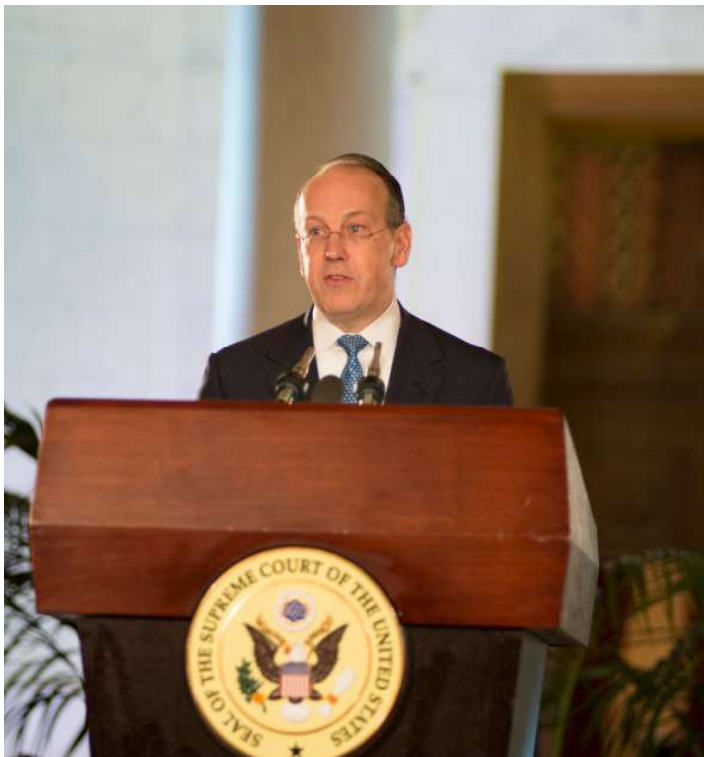
Former Solicitor General Paul Clement represented the Supreme Court Bar.

The portrait of Justice Scalia is now displayed with other portraits of recent Justices of the Supreme Court on the ground floor of the Supreme Court Building. It was painted in the year 2007 in the studio of portrait artist Nelson Shanks.