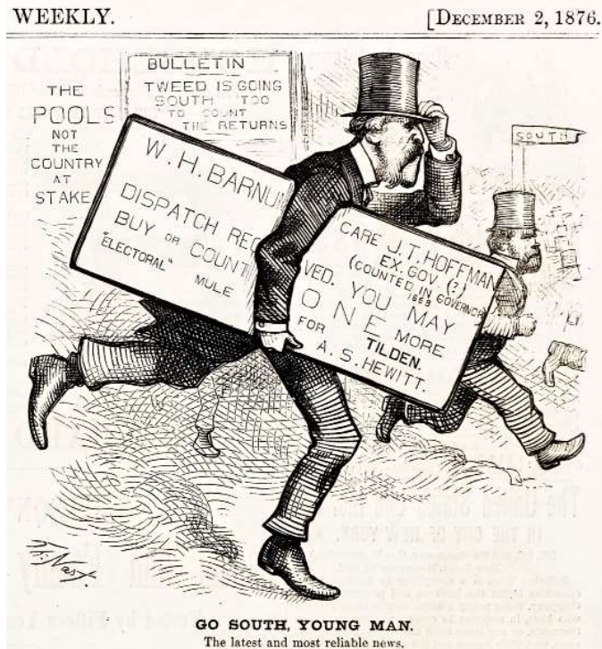
A note from New York politician Abram S. Hewitt pledges support for Tilden: "You may BUY or COUNT ONE more 'Electoral' Mule for Tilden." He urges the messenger to go South in search of more votes.

In his single term, Hayes was able to appoint two Justices to the Court. The first, John Marshall Harlan, served for 34 years and is one of the Court's towering 19 th century figures. He is most famous for his eloquent dissent in Plessy vs. Ferguson . Plessy is, of course, the case that made separate but equal treatment of African-American citizens constitutional. It was, therefore, the basis for much of the Jim Crow legislation later overturned in Brown vs. Board of Education . President Hayes had a second appointment when he named William B. Woods to the Court. Woods served only a brief six years and does not figure prominently in the Court's history.