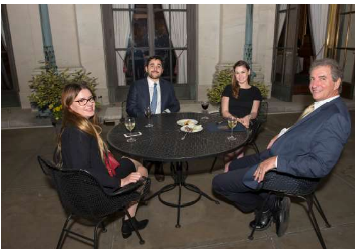
Warm weather allowed guests to enjoy the reception on the patio off the Conference room.