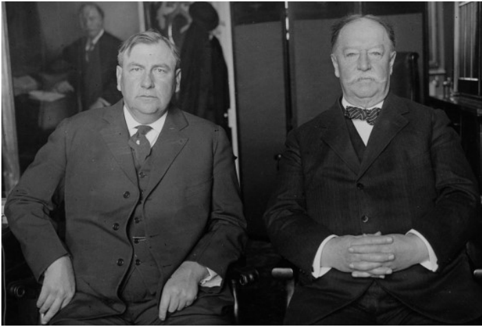
and William Howard Taft

as a member of the Arizona State Senate. She was elected majority leader of that body in 1972, the first woman to hold such office anywhere in the United States.