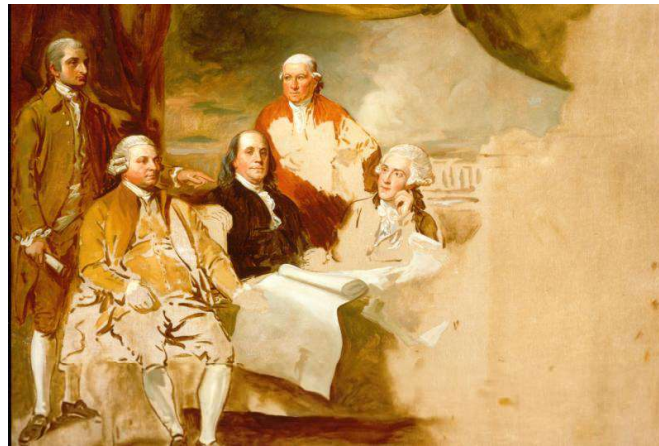
John Jay is shown standing at the far left edge of this incomplete painting of the signing of the Treaty of Paris. Benjamin Franklin is the second seated figure from the left.

Jay returned to New York with Sarah on July 24, 1784, five years after he left. When he stepped off the ship he was hailed as though a conquering hero. There was little rest for the weary though as Congress had appointed Jay to the office of Secretary of Foreign Affairs. Jay immediately accepted, despite his fatigue. Jay dutifully fulfilled his role as Foreign Affairs Secretary for three years, eschewing larger domestic issues facing the newly independent United States. Jay was not involved with any convention or committee work leading up to the Constitutional Convention in 1787; in fact, his political enemy, New York Governor George Clinton, maneuvered to prevent Jay from being part of the state's delegation to Philadelphia in 1787. (Thus Jay missed being a signer of the Constitution too.)