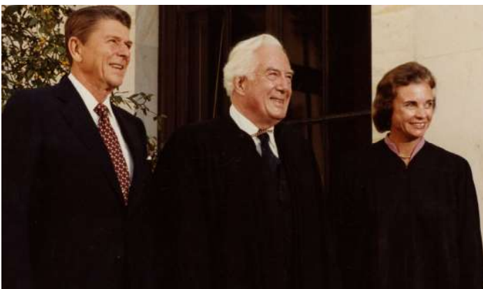
President Ronald Reagan, Chief Justice Warren Burger and Sandra Day O'Connor

10) Richard Nixon appointed Lewis F. Powell in 1971.