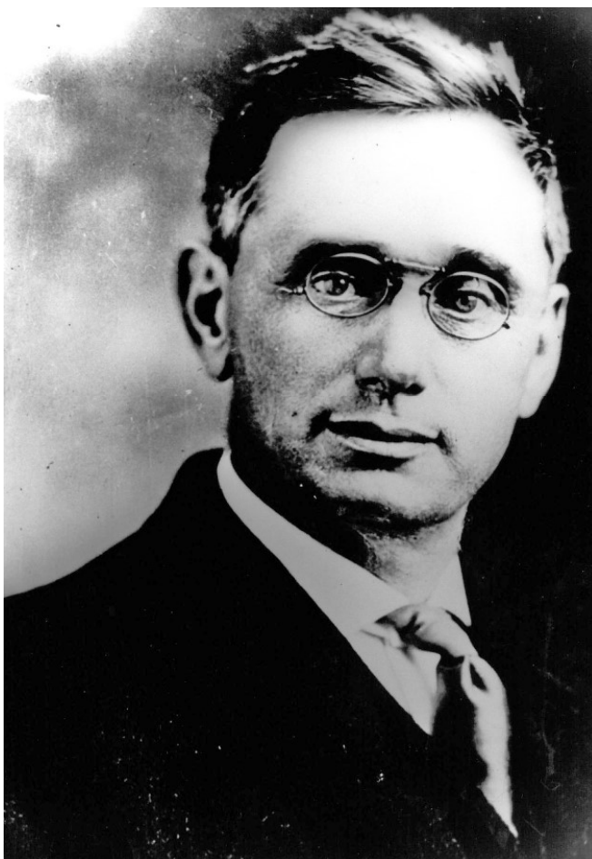
Louis Dembitz Brandeis was an Associate Justice of the Supreme Court of the United States from 1916 to 1939. On June 1, 1916 he was confirmed by the Senate by a vote of 47 to 22.

Justice Kagan spoke eloquently about her own appreciation of Brandeis and his contributions to the law. She noted that she sits in the Brandeis seat on the Court. The Justice added that her favorite Supreme Court opinion of all time is Brandeis' concurring opinion in the Whitney case. She observed that in the opinion the Justice "connects to the