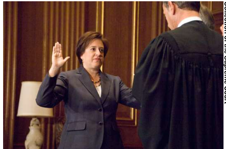
Elena Kagan being sworn in by Chief Justice Roberts

2) Franklin D. Roosevelt, a Democrat, appointed Harlan Fiske Stone, a Republican, to serve as Chief Justice in 1941.