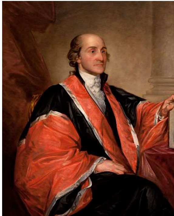
Collection of the Supreme Court