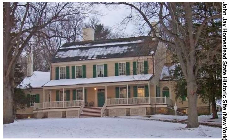
After he retired from public life, Jay retired to his home Bedford House located in Katonah, New York.

Two of the reasons Jay loses credit for his Supreme Court work are 1) he left early to negotiate a treaty with the British in 1794 which has come to be known as the Jay Treaty, a much maligned document; and 2) the thirty-five years John Marshall occupied the Chief’s chair. His work in Britain was not unrelated to his work as a Justice. Jay was very concerned over the disregard of key provisions of the 1783 Peace Treaty which he helped to negotiate. Specifically, Jay was concerned about repayment of British debt contracted before the Revolution and the ways states were ignoring the provisions of the Treaty calling for repayment of contracted debt. Jay was intimately aware of the issue not just from the standpoint of his work on the Treaty ten years earlier as a negotiator, but also through his work on the Court. Not only did these cases highlight the extent to which states were going to ignore the Treaty, it also illustrated the level of animosity