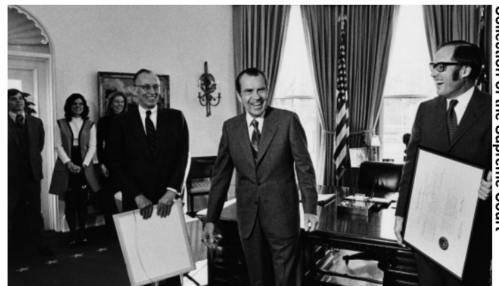
Nixon Confirmed William Rehnquist and Lewis F. Powell as Associate Justices of the Supreme Court