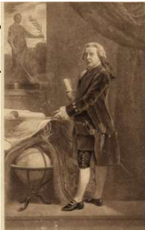
Vice-President John Adams crossed party lines to appoint John Marshall.

7) Franklin D. Roosevelt appointed Stanley Reed in 1938.