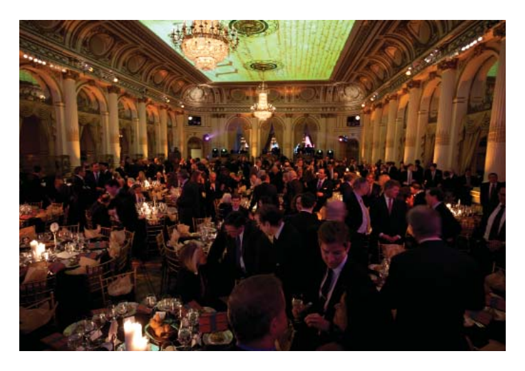
Guests are shown at the dinner portion of the Inaugural Gala held in March 2013. The Ballroom of the Plaza Hotel in New York will be the setting for the Second Gala on October 28, 2014.

This year we celebrate the 40th Anniversary of the Society which was founded in 1974. On behalf of the Officers and Trustees, let me offer our thanks for your support of the Society and its many activities. We also welcome, and are grateful to receive your ideas, articles and contributions of time and effort. The events planned for the year will be as successful as your participation makes them. I encourage you to visit the website now and make plans to attend or support our outstanding events.