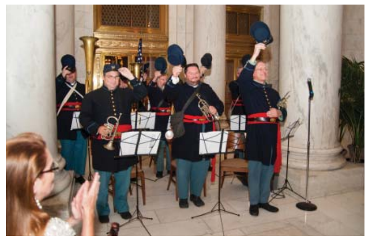
The members of the Federal City Band doff their caps in salute to the audience following their performance on June 4.