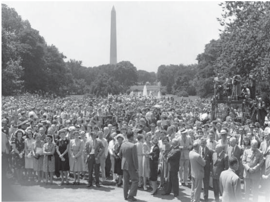
A news photographer took this picture of the crowd gathered on the White House grounds for the swearing-in ceremony of Chief Justice Fred M. Vinson.

Supreme Court) were shocked. They found the event undignified and wondered if it reflected a “hick” notion of how to emphasize the importance of Vinson’s job. More substantively, they feared that it exhibited Democratic Party glee at “capturing” the chief justiceship. (Stone, although elevated by FDR to Chief Justice, had been appointed an Associate Justice by President Coolidge,