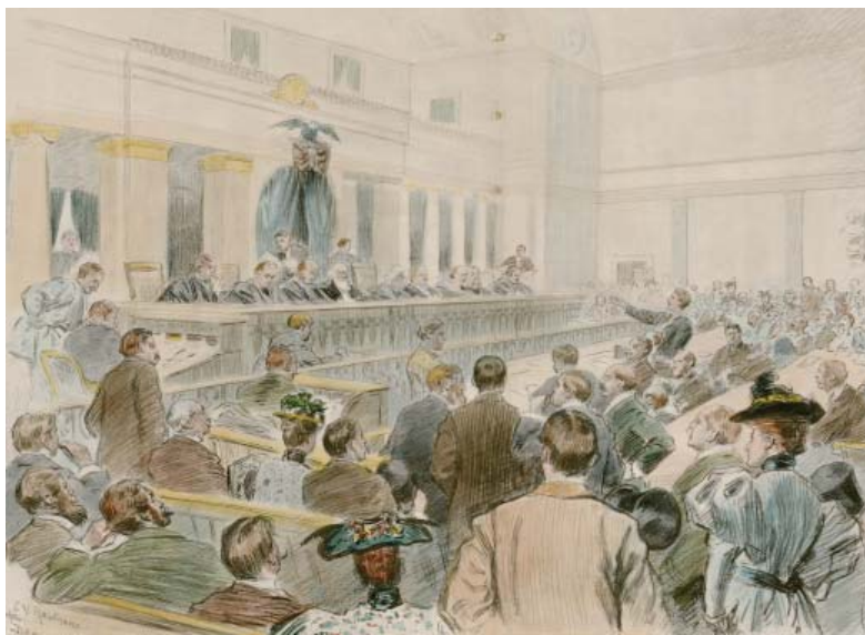
The crowded Court Room is shown during oral argument in Pollock. There was keen public interest in the case and the arguments drew a large audience.