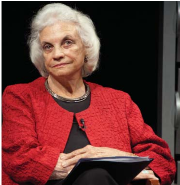
Justice Sandra Day O'Connor's trail-blazing career was the subject of a panel discussion