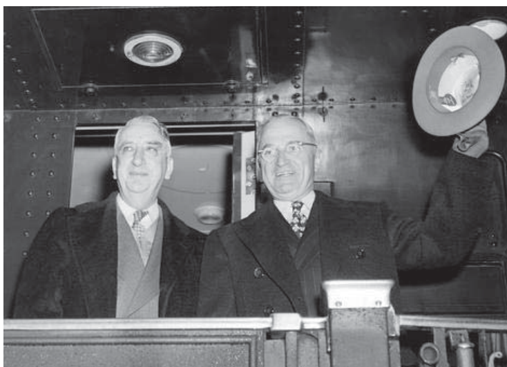
Fred Vinson, (left) and President Truman were close friends and Vinson occasionally appeared with him publicly. Here they are shown during a "Whistle Stop Campaign Stop," greeting the crowd from the back of a train.

After a benediction by the Chaplain of the U. S. Senate, the ceremony ended with the Navy Band playing "The Star Spangled Banner." The President and the Chief Justice walked into the White House and received congratulations in the East Room. (Later they walked to the Treasury Department next door and Chief Justice Vinson swore in his successor as Secretary of that department, John W. Snyder.)