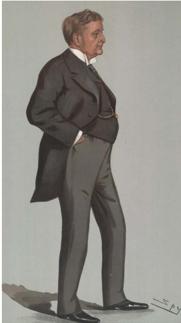
In his oral argument in the Pollock case, Joseph Choate maintained “that the fundamental object of all civilized government was the preservation of the right of private property.”

As the argument evolved, Choate's strategy became clear; he would say little more about the Act's public policy aspects, on which his adversaries had ably focused, but rather concentrate on the Constitution, in particular the definition of “direct tax” and how the Act had ignored the constitutional requirement in Section 1 that, as he described it, these revenues be “apportioned among the states according to their respective numbers.” The Act's tax on real estate income and income from personal property, such as stocks and bonds, was a direct tax. In the case of real estate, it was no different than a tax on the land from which the income was derived. Additionally he argued that the tax on income from municipal bonds impinged on States' sovereignty, for they relied on these instruments to fund their governments.