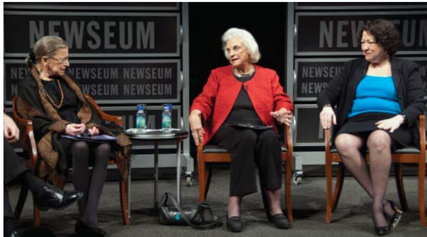
Justice O’Connor (center) responds to a comment from Justice Ginsburg while Justice Sotomayor looks on.

Other questions posed included what each Justice had found the most difficult adjustment for them personally upon joining the Bench. Justice O’Connor said that for her the most difficult thing was to write opinions that not only deal with the issues, but also do so in a way that will be