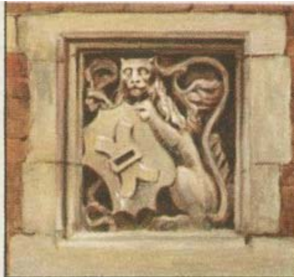
New York Public Library