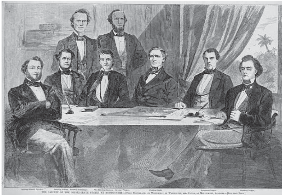
Judah Benjamin (seated, far left) served in several positions in the Confederate Cabinet including Attorney General and Secretary of State.