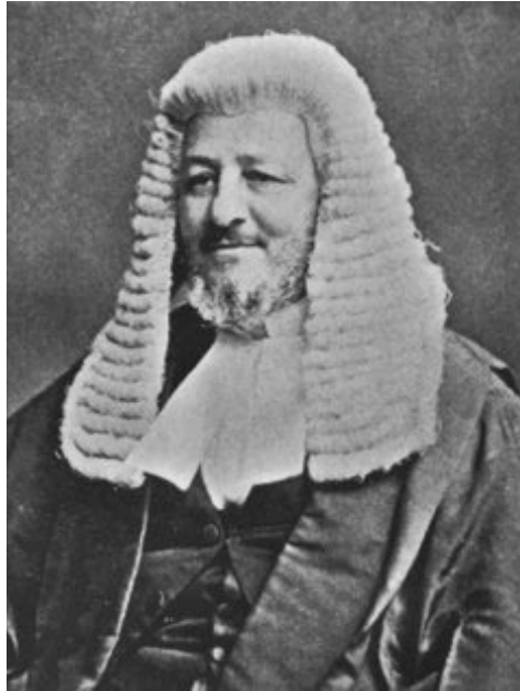
The Queen's Counsel

[F]rom the Bar of England, I never, so far as I am aware, received anything but warm and kindly welcome. I never had occasion to feel that any one regarded me as an intruder. I never felt a touch of professional jealousy. I never received any unkindness; on the contrary, from all quarters I received a warm and cordial welcome, to which, as a stranger, I had no title, except that I was a political exile,