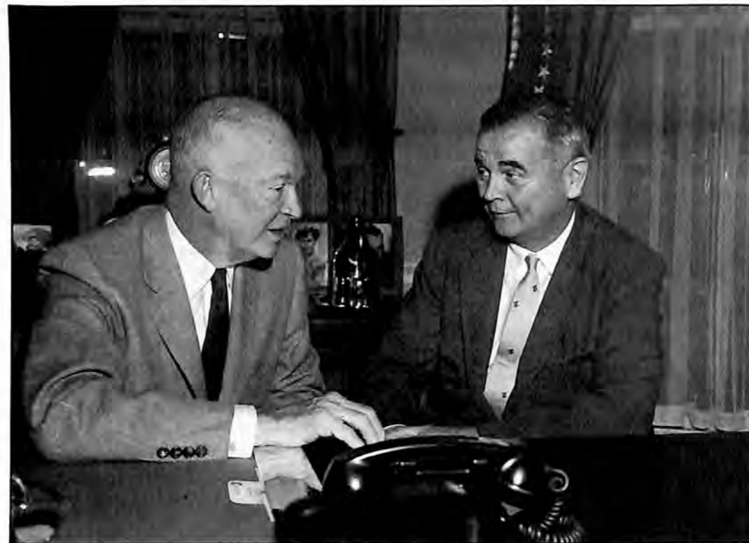
On October 1, 1956, President Eisenhower had an animated chat with his nominee to the Court. The Rumson, New Jersey judge was the first Catholic appointed to the High Court since Frank Murphy's death in 1949.