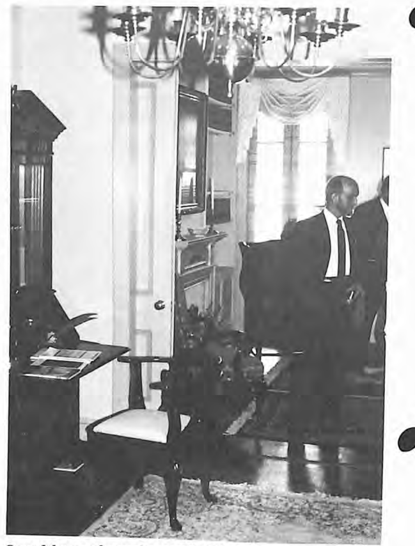
One of the members who attended the informal reception held in the Society's headquarters building following the annual lecture. The building's main floor is furnished in the early nineteenth century style.

At six o'clock, in the Supreme Court chamber where attorneys have addressed the Supreme Court since 1935, Governor