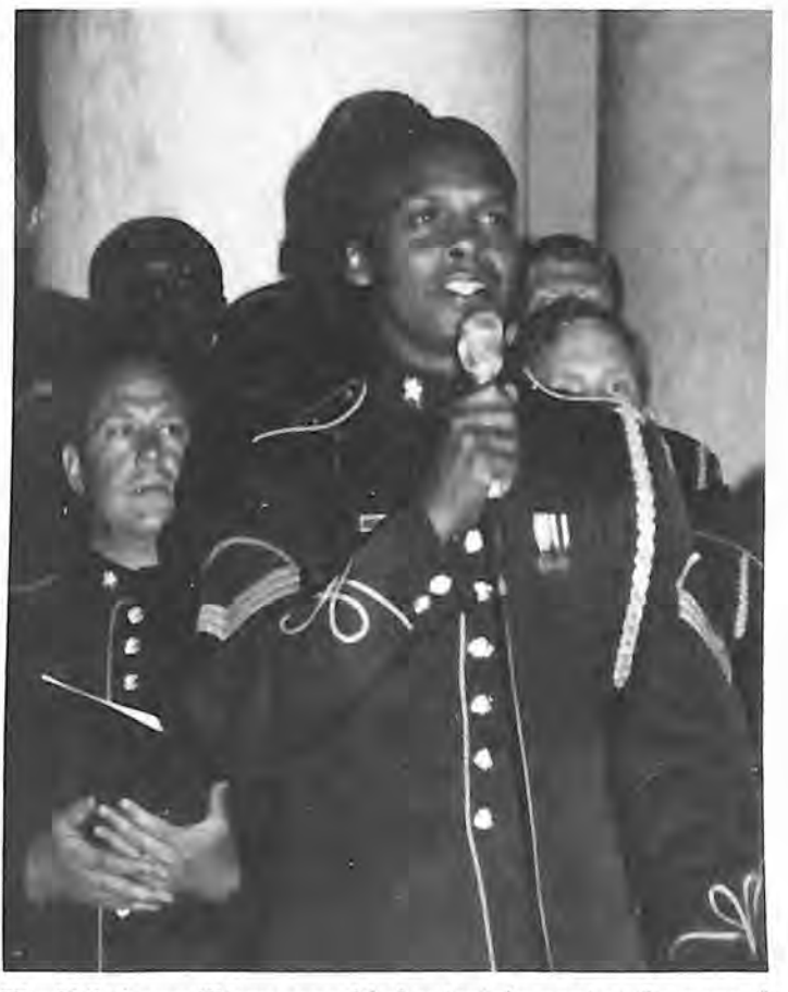
The U.S. Army Chorus provided entertainment at the annual dinner.

Following the meetings, members adjourned to the Court's East and West Conference rooms for the Society's eleventh annual reception. Entertainment for this event was provided by the U.S. Army Band ensembles. At 8:00 PM, members gathered in the Great Hall of the Supreme Court building for the annual dinner where they were treated to an after-dinner performance by the Army's Strolling Strings and the U.S. Army Chorus.