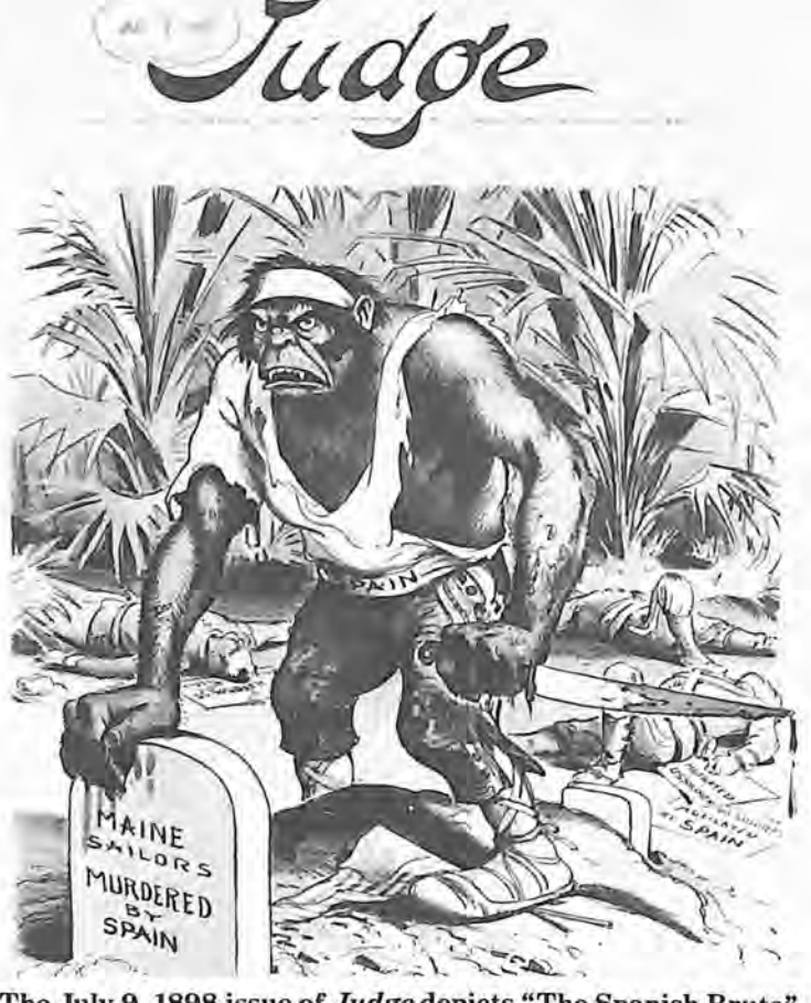
The July 9, 1898 issue of Judge depicts "The Spanish Brute" committing atrocities against American soldiers following the Maine incident.