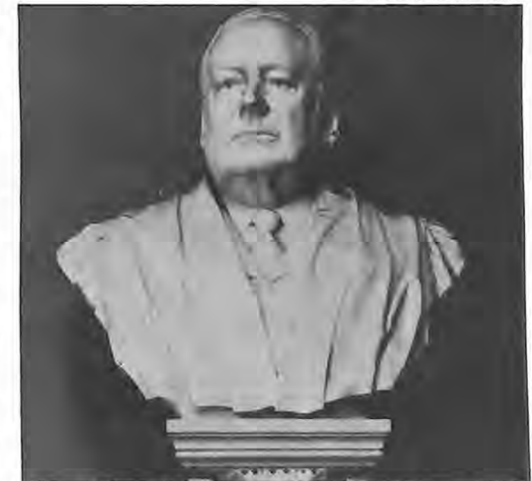
Bryant Baker's bust of Chief Justice White is now on display in the Supreme Court's Great Hall.