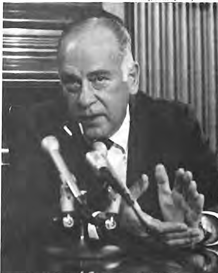
Justice Potter Stewart announces his retirement to the press.