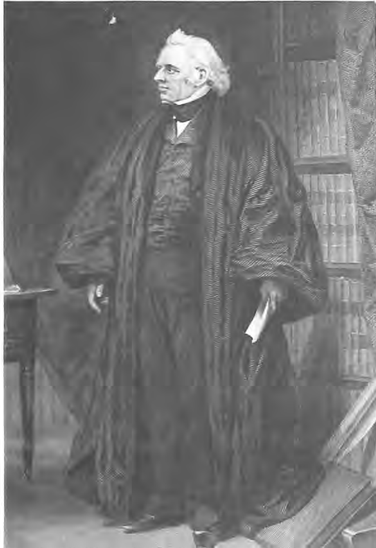
Justice Joseph Story—the father

While serving on the Court, Story retained an active interest in many of the projects which had gained his attention as one of