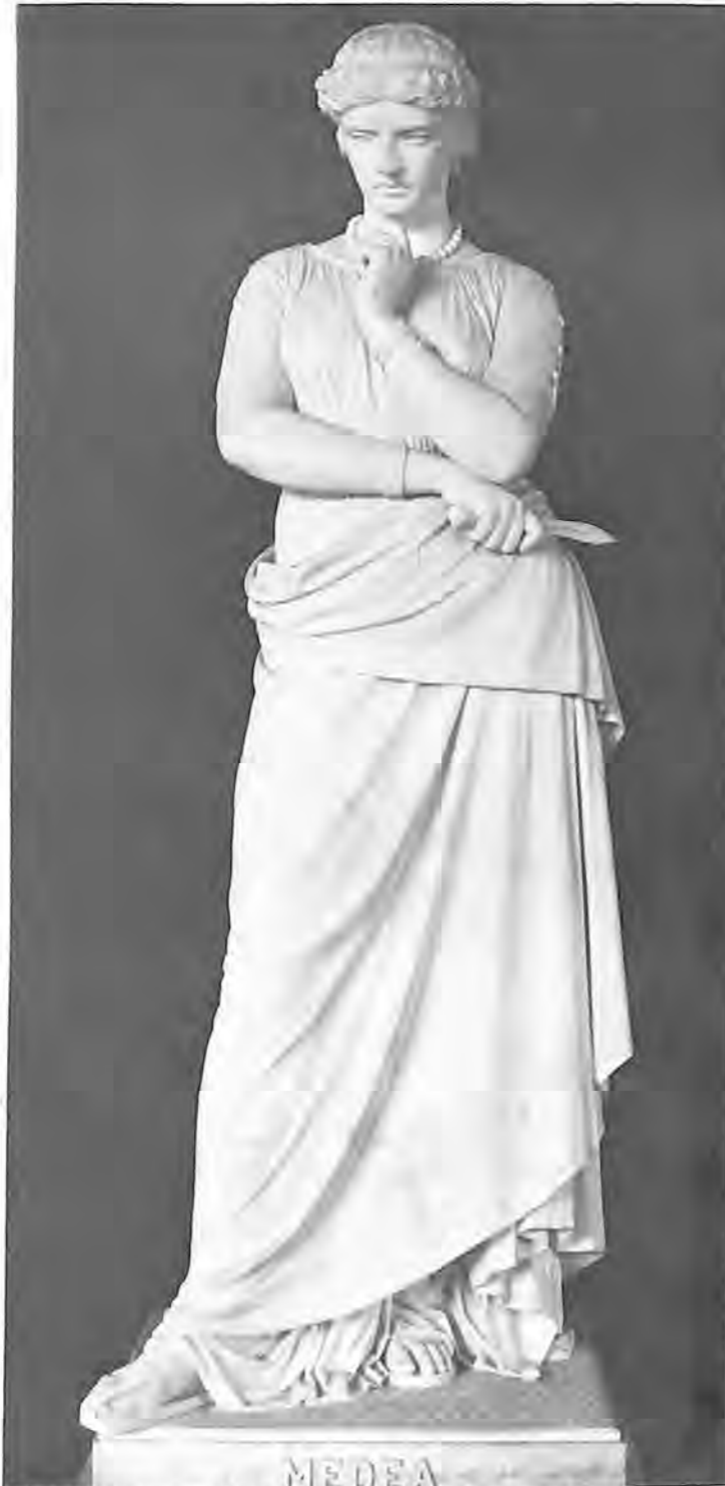
"The Medea"—one of Story's famous figures from Greek mythology.