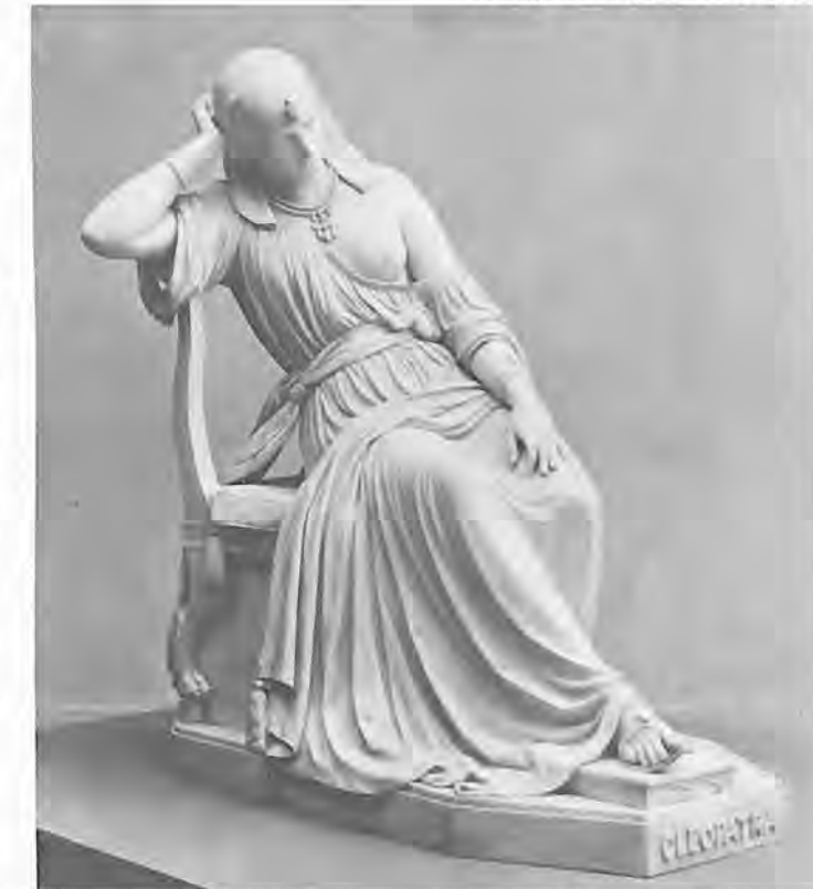
"The Cleopatra"—Story's most celebrated heroic sculpture.