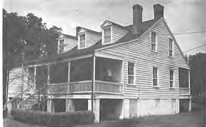
Edward Douglass White's plantation home at Thibodaux, Louisiana.