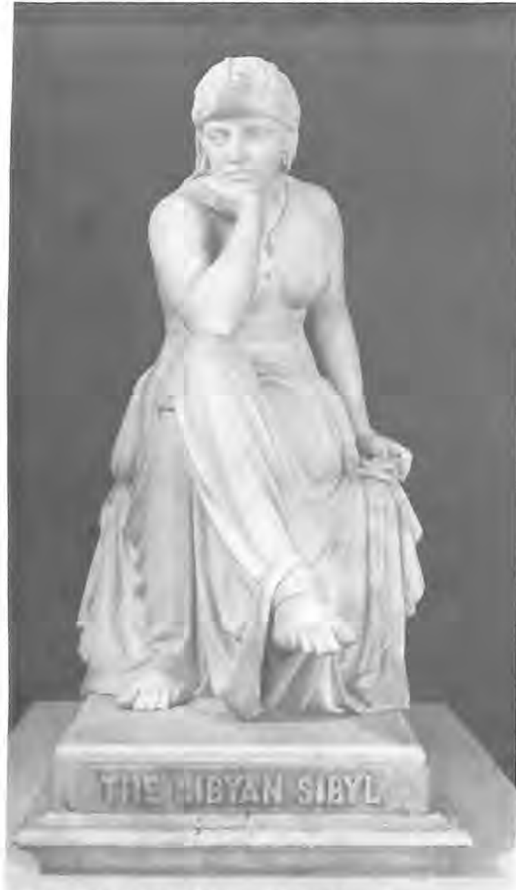
"The Libyan Sibyl"—Story's statement against slavery